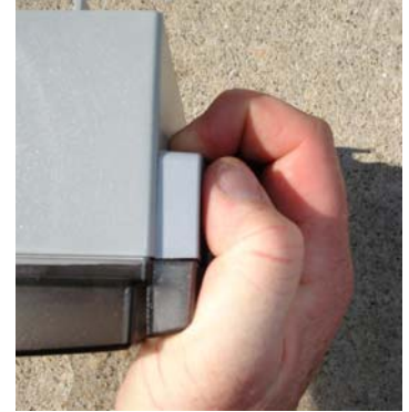
Press to close enclosure!

It provides non-contacting level, volume, advanced pump control, differential level, and open channel flow with 5 user-defined relays. Comes standard with 110VAC and 24VDC with an isolated 4-20 mA output.